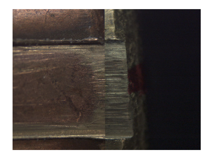
FIG. 1—Kit # 22 Ex 1098 to Ex 1267 28X, LIMP 1.1

FMJ, Full Metal Jacket; JHP, Jacketed Hollow Point.