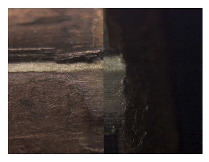
FIG. 2-Kit # 22 Ex 1288 to Ex 1124 55X, LIMP 2.