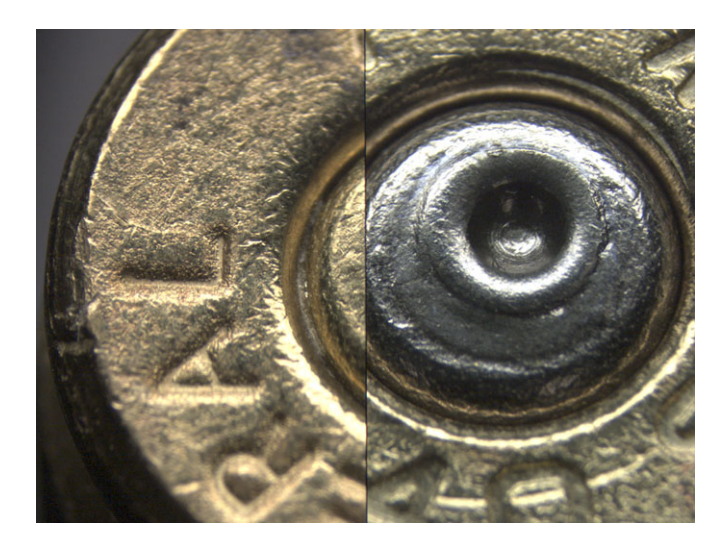
FIG. 4-Kit # 27 Ex 1191 to Ex 1834 14X, BFM 2.2