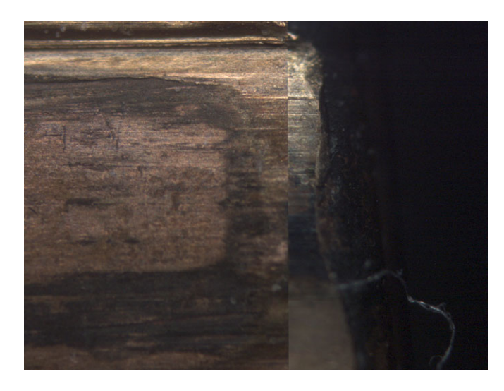
FIG. 3-Kit # 22 Ex 1288 to Ex 1844 55X, LIMP 1.